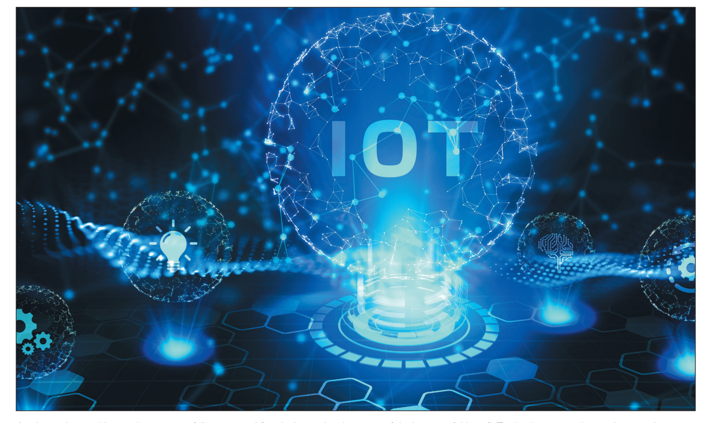
Another major trend is a push to create a fully connected fleet by leveraging the power of the internet of things (IoT) – leasing companies can become the repositories for all the IoT data streaming out of cars and assets.

New technology (IoT). Another major trend is a push to create a fully connected fleet by leveraging the power of the internet of things (IoT). This creates tremendous operational efficiency by allowing the fleet to be monitored digitally for maintenance, safety, recalls, and loss management. As well as providing operational advantage today, the millions of data points created each day can be used for future gain by providing teaching data to